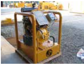
Pair with the APE Model 33 Power Unit